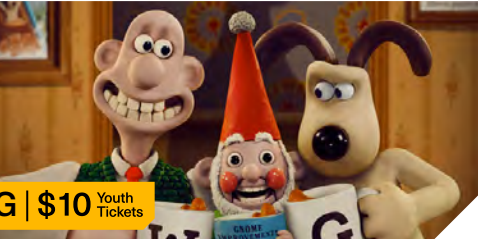
G | $10 Youth Tickets