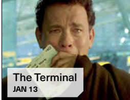
The Terminal JAN 13

PANTHEON: Parasite • VC 6:00pm Barking Dogs Never Bite • VC 8:45pm