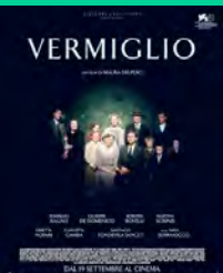
FRI 3 JAN, 2:00PM