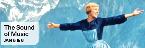
The Sound of Music JAN 5 & 6

The Sound of Music • VC 3:00pm Theater of Thought • LOC 3:30pm So Surreal: Behind ... • LOC 5:45pm New Spanish Cinema: They Will Be Dust • VC 6:20pm Living Together • LOC 7:45pm New Spanish Cinema: I Am Nevenka • VC 8:40pm