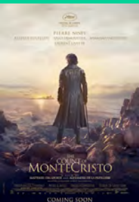
FRI 20 DEC, 1:00PM