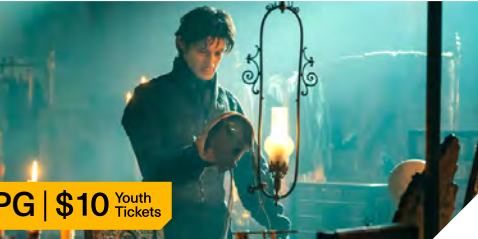
PG | $10 Youth Tickets