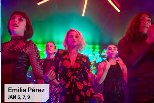
Emilia Pérez JAN 5, 7, 9

Vermiglio • VC 3:00pm All We Imagine as Light • LOC 3:30pm So Surreal: Behind the Masks • VC 5:30pm Theater of Thought • LOC 6:00pm Vermiglio • VC 7:30pm Living Together • LOC 8:15pm