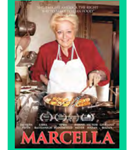
FRI 9 MAY, 1:00PM