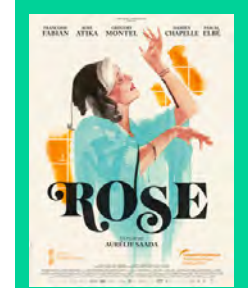
FRI 2 MAY, 1:30PM