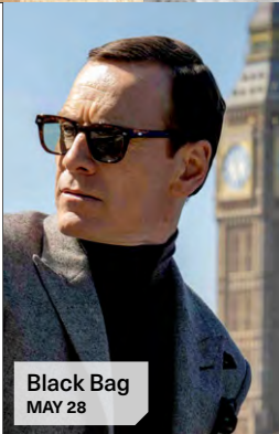
Black Bag MAY 28

3 Art of Adventure • VC 1:00pm Two Strangers Trying Not to Kill Each Other • LOC 1:30pm Blue Road - The Edna O'Brien Story • LOC 3:45pm Do You Love Me • LOC 6:00pm Everyone Is Lying to You for Money • LOC 7:45pm