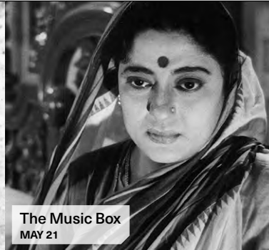
The Music Box MAY 21

1 MAY Everyone Is Lying to You for Money • VC 2:00pm Erupcja • LOC 2:30pm Suburban Fury • LOC 4:30pm Do You Love Me • LOC 7:15pm