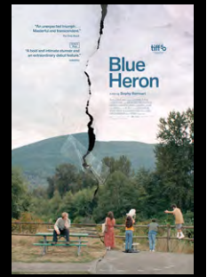
FRI 08 MAY, 2:00PM

Become a VIFF+ member. See more films, save on tickets, enjoy amazing membership perks.