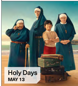
Holy Days MAY 13

13 Last One for the Road • VC 5:40pm Blue Heron • VC 7:50pm Holy Days • LOC 8:10pm