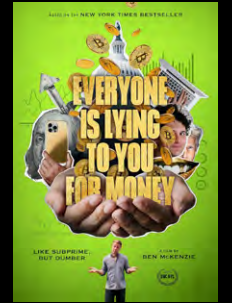
FRI 01 MAY, 2:00PM