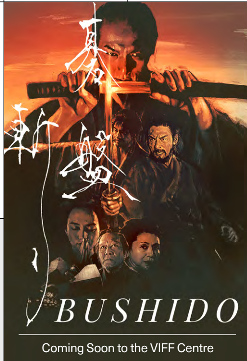
BUSHIDO Coming Soon to the VIFF Centre

14 Grapes of Wrath • VC 11:00am Last One for the Road • LOC 2:00pm Blue Heron • VC 3:00pm How Deep Is Your Love • LOC 4:15pm Blue Heron • VC 5:00pm Omaha • LOC 6:30pm Blue Heron • VC 7:00pm