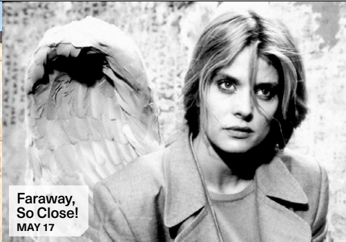
Faraway, So Close! MAY 17