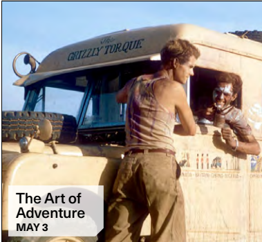
The Art of Adventure MAY 3